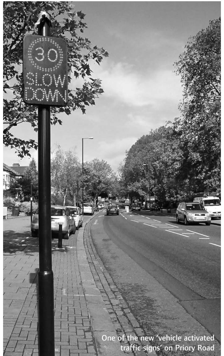
One of the new 'vehicle activated traffic signs' on Priory Road

These light up with a sign saying '30mph Slow Down' when approaching vehicles are driving at more than the speed limit. VATS do not provide evidence to prosecute individual motorists but they do provide data on traffic speeds over different periods of time. Research has shown that such signs cut traffic speeds by 10% with a 50% reduction in casualties. Since they have been installed it is clear that most cars do tend to slow down on seeing them although there is still the minority of recalcitrant drivers who seem to ignore any limits.